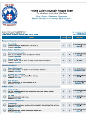
Image of the website forum -

Use the forum to make your suggestions to improve what we do, make announcements or sell that kit you want to get rid of. If not at least visit it to keep up with the news.