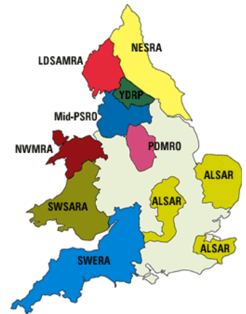
Map showing MRC's Panels in England and Wales.