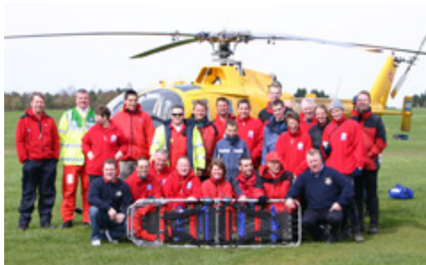
Presentation of the new stretcher by the Colne Valley Lions

This photo was passed onto the Lions and made it into the Huddersfield Examiner